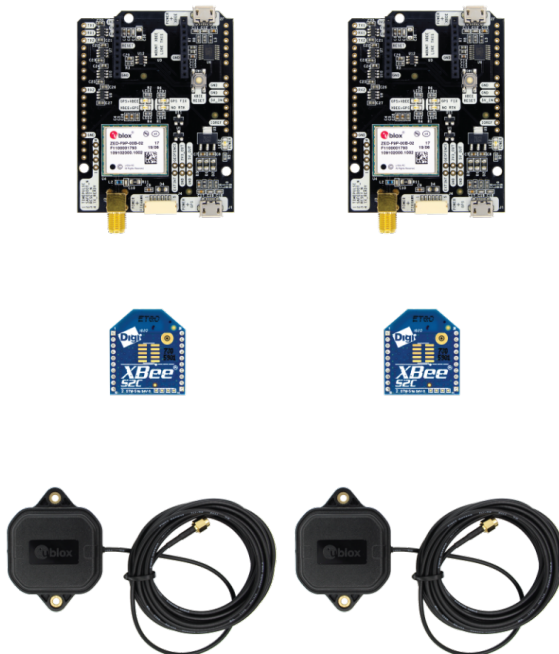
simpleRTK2B – Starter Kit MR