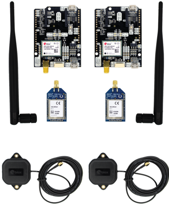
simpleRTK2B – Starter Kit LR